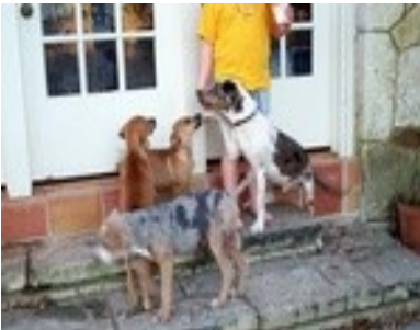
Hog Dogs Make Great Companions Too.