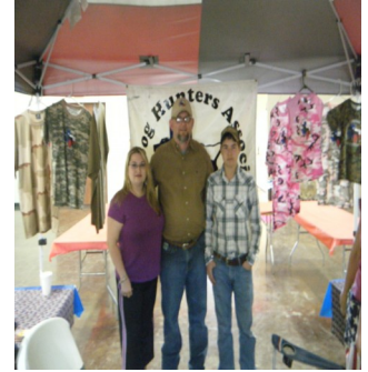
TDHA Booth Creekside Christian Fellowship Hunting & Fishing Show May 1-2, 2010 Needville, Texas

This was a family oriented event and it was so much fun had by all. Watching the Dock Dogs go jump was a really cool event that I loved watching. The Duck Commander, Phil Robertson was a HUGE hit and I enjoyed listening to his testimonial. Every child there was in