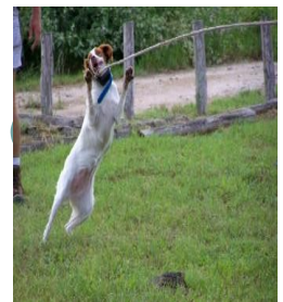
Snake Avoidance Training

months. There has been more news from Red Rock ( the company that makes the vaccine ) that dogs under 25 lbs and over 100 lbs need a series of boosters every 4 weeks for a total of 3 shots and then every 6 months. I live in snake country and my dogs could come across one right here in the yard, so I keep