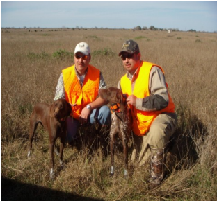
German Shorthair Pointers on a south Texas Upland Bird Hunt